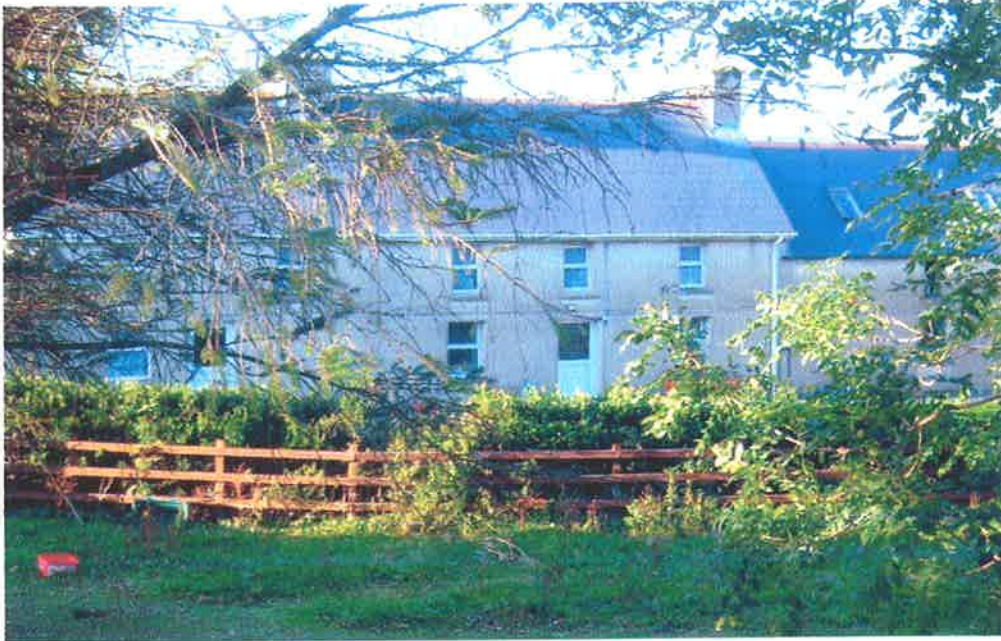
This is the farmhouse in the article.