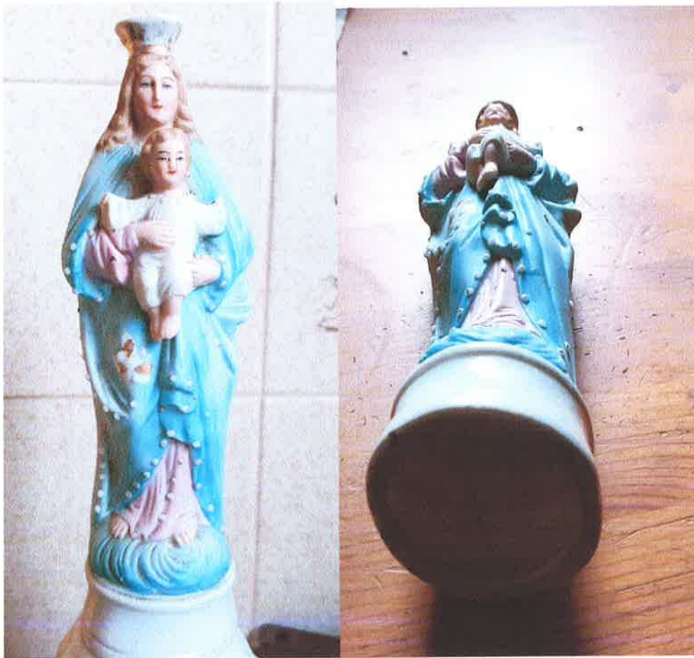
This is the statue that the article was kept in