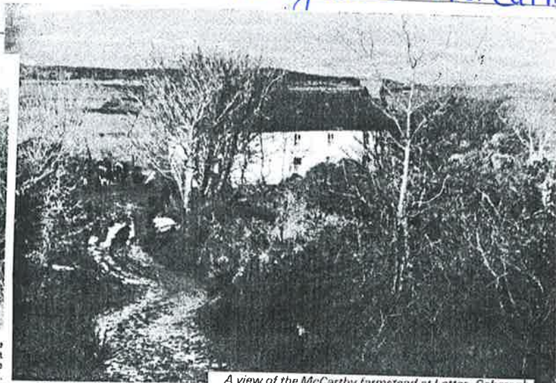
A view of the McCarthy farmstead at Letter, Caheragh.