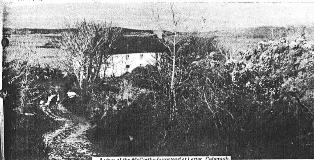
A view of the McCarthy farmstead at Letter, Caheragh.