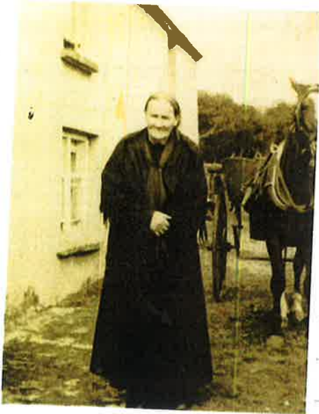
my Nanny's Grandmother