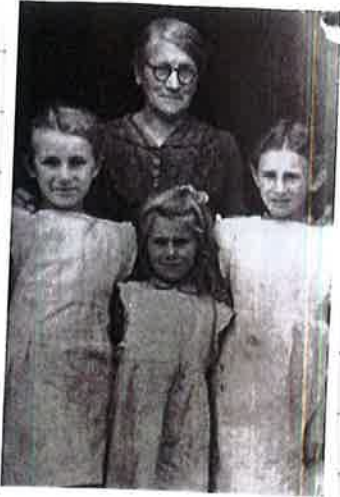
My Grannys Auntie with her cousins.