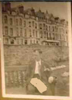
I.O.H. 1934 post Holiday