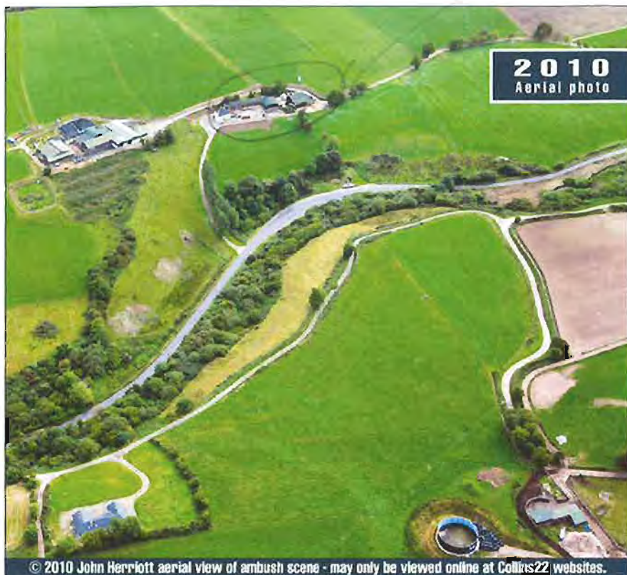
Current photo of the ambush site with the monument to Michael Collins.