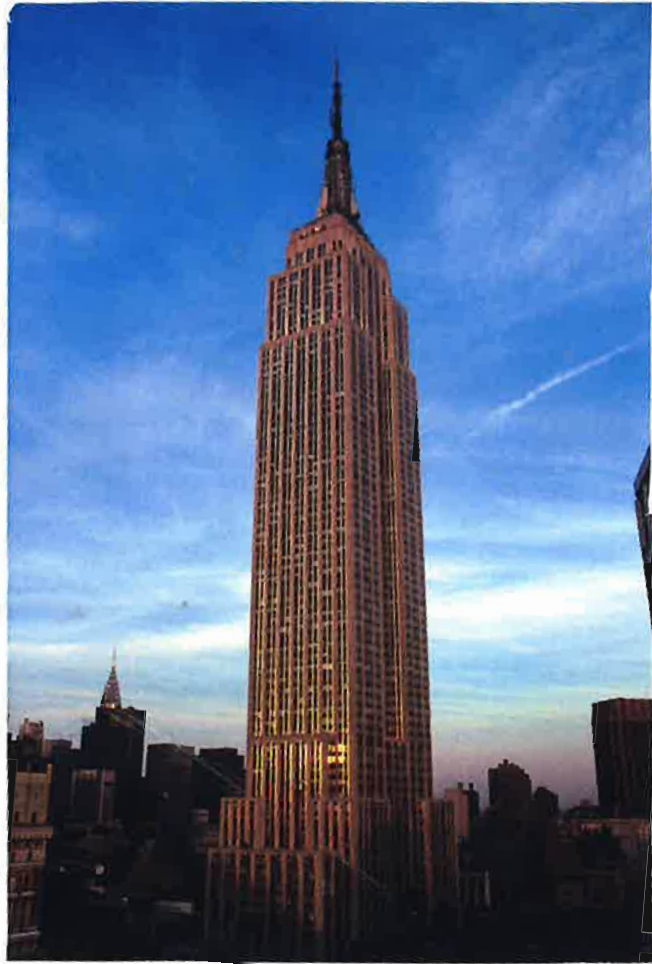
Empire state building