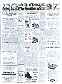
Saturday, 30 January 1954