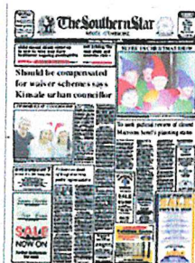
Saturday, 06 January 2001