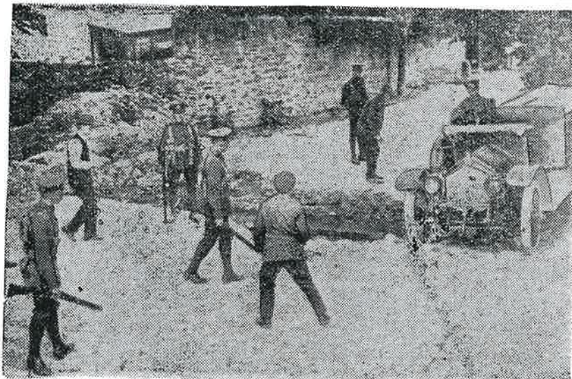
Bridges were blown up and roads trenched to impede the move- ments of Britain's armed Forces.