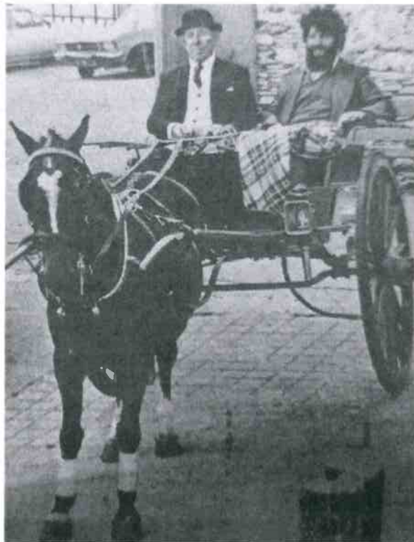
Picture of My Grandad and Great Grandad in 1972