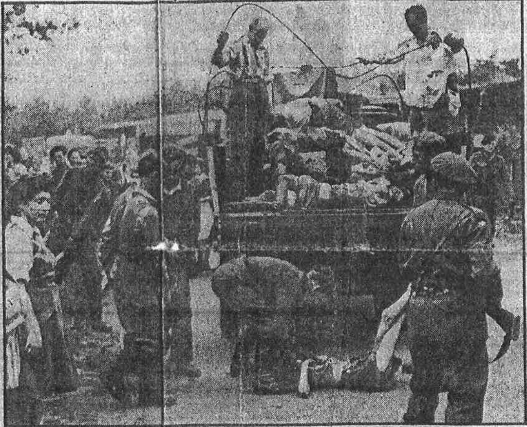
The jailer-prisoners carry out the dead

It is vital for future peace that this country should play a united part in international reconstruction. It can do this only under the leadership of Mr. Churchill and Mr. Eden, who have done