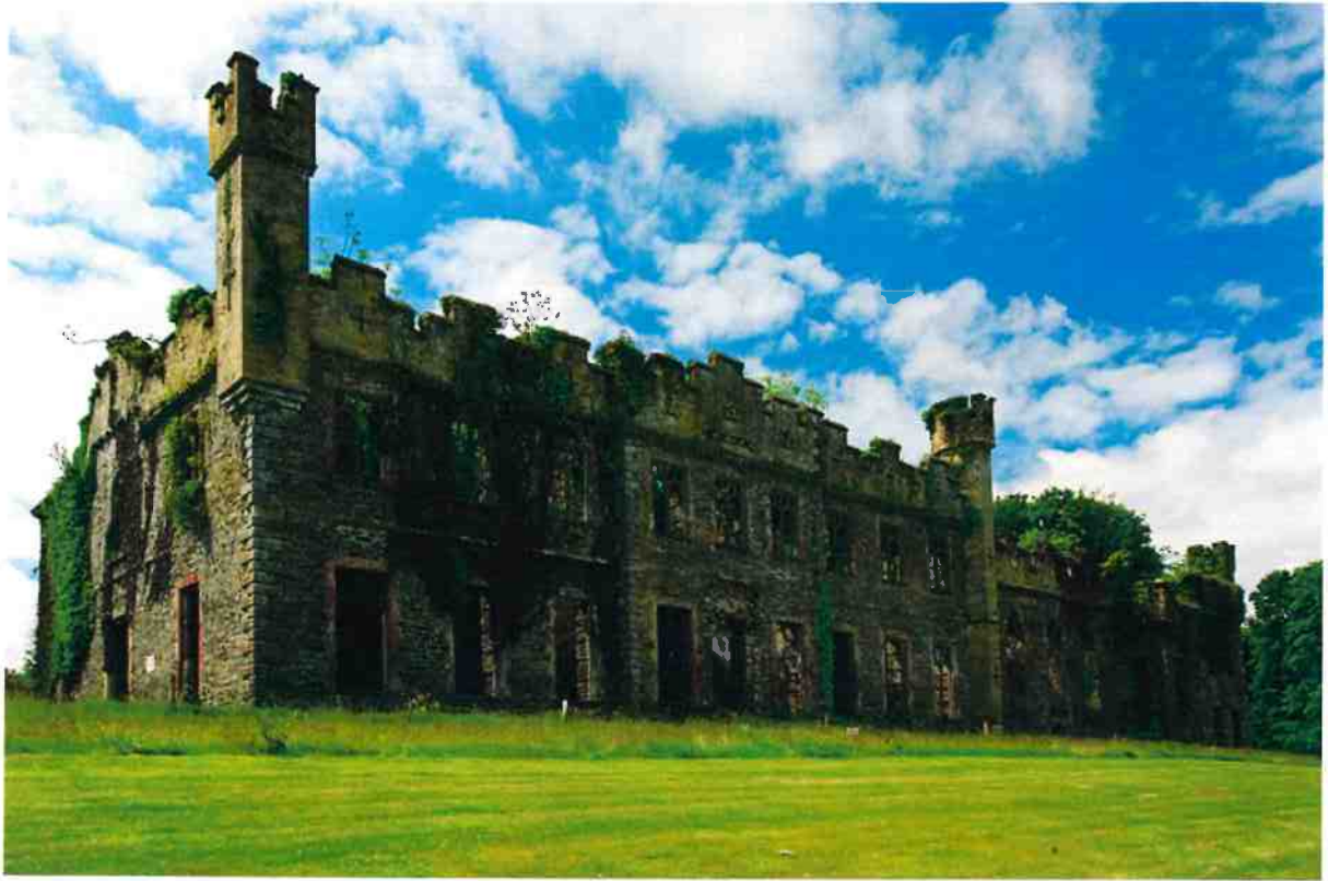
Castle Bernard today