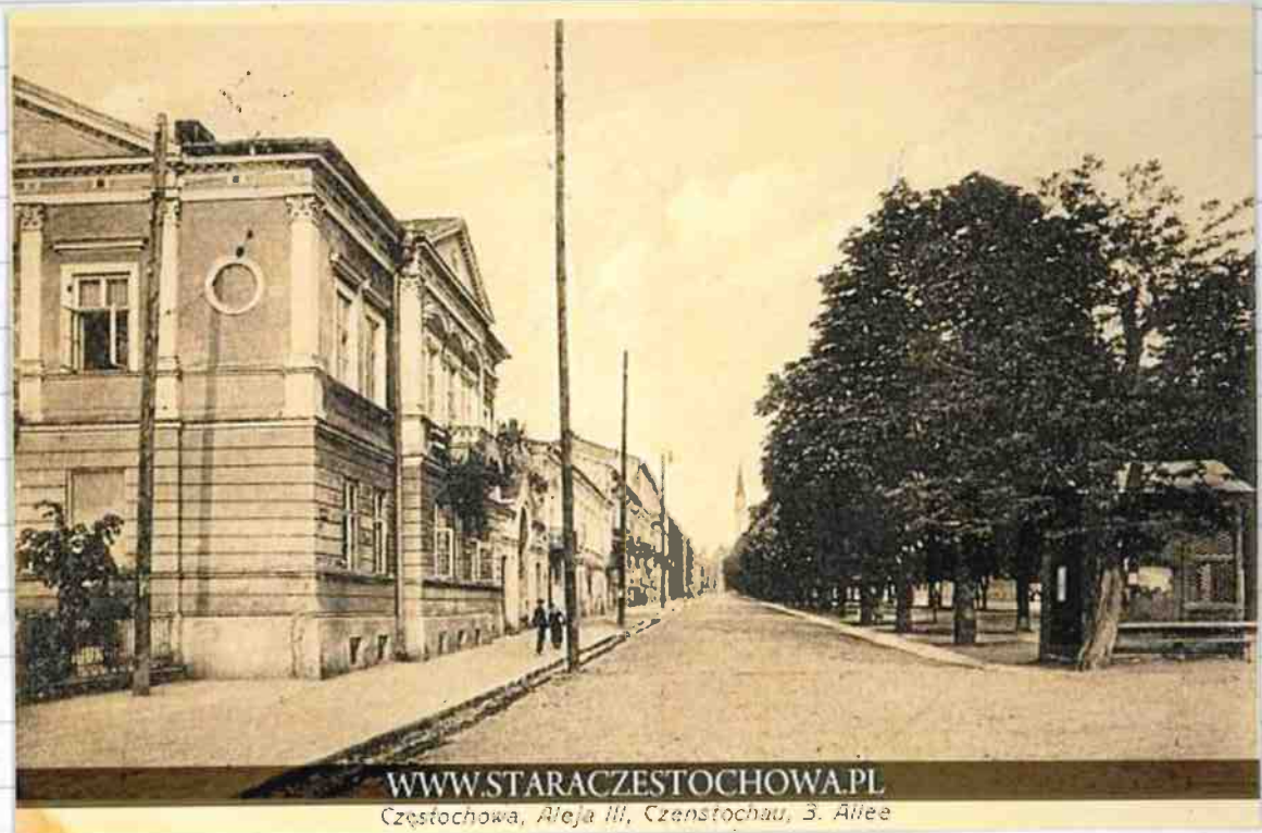
WWW.STARACZESTOCHOWA.PL Częstochowa, Aleja III, Czenstochau, 3. Allee