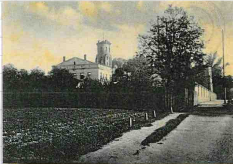
Ratusz od tyłu widziany