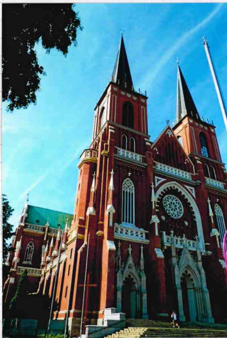
Now, front view ↗

I remember the red bricks that the cathedral is built out of. My mom went to high school not far from the Cathedral.