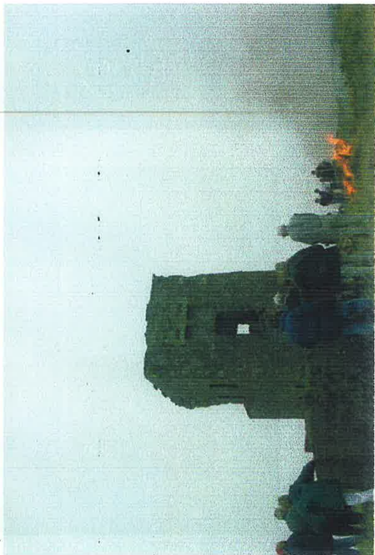
The 75 th anniversary