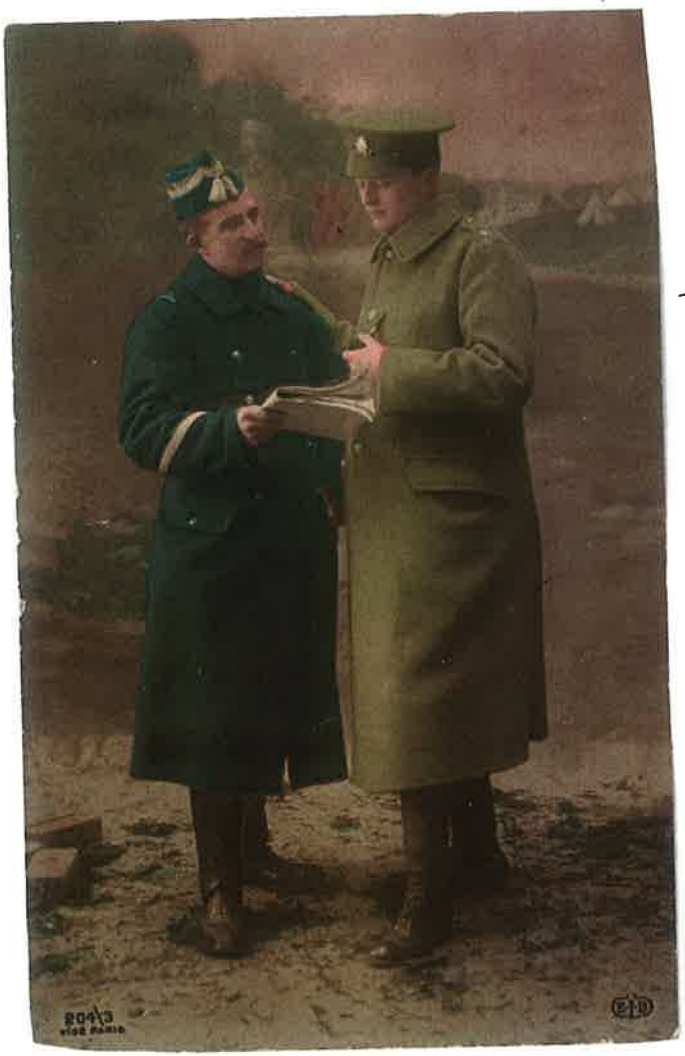
Post card cover and back