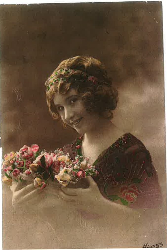
Postcard front and back.